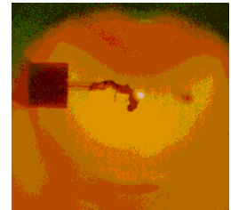
Unburnable coke residue formation during combustion

PRI-D contains proprietary thermal stability chemistries that disrupt the thermal cracking process during the second combustion stage. In so doing, PRI-D prevents the formation of higher weight volatiles. More fuel is permitted to burn, releasing more BTUs. With more complete combustion, coke formation is also minimized. As a result, deposits and exhaust particulates are dramatically reduced.